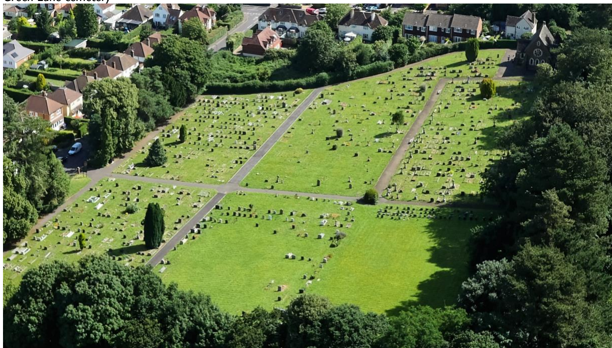
Green Lane cemetery