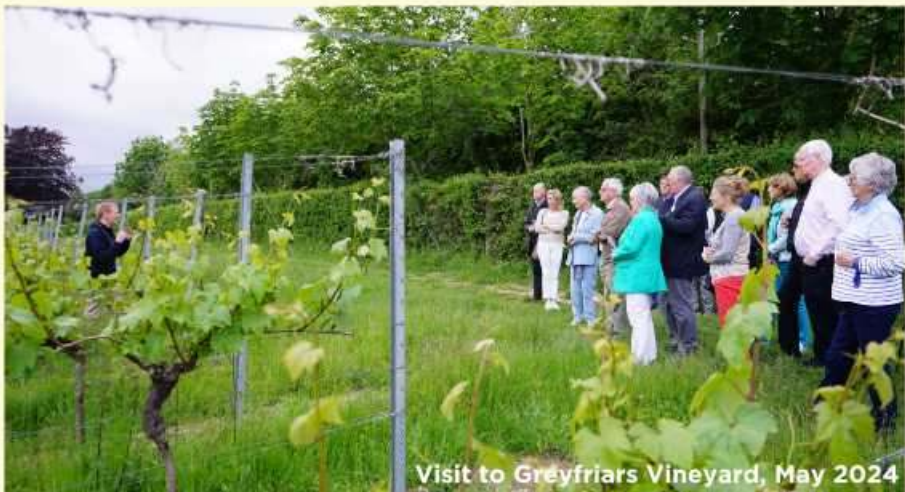
Visit to Greyfriars Vineyard, May 2024

You can join via our website at farnhamsociety.org.uk