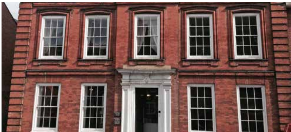
38 West Street, Willmer House, Map 2. Open Tue-Sat, 10.00-17.00.

A good place to start your walk around Farnham is at the Museum of Farnham. The Grade 1 Listed Building was built in 1718. There is a peaceful walled rear garden, with the modern Garden Gallery at the end.